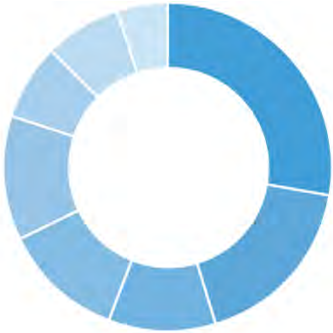
Total Operating Expenses $13,282,319